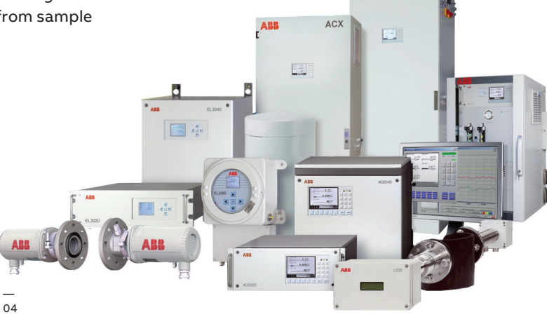
ABB provides all major international certificates for CEMS, hazardous area installations, metrological approvals, electrical safety and quality and environmental management.